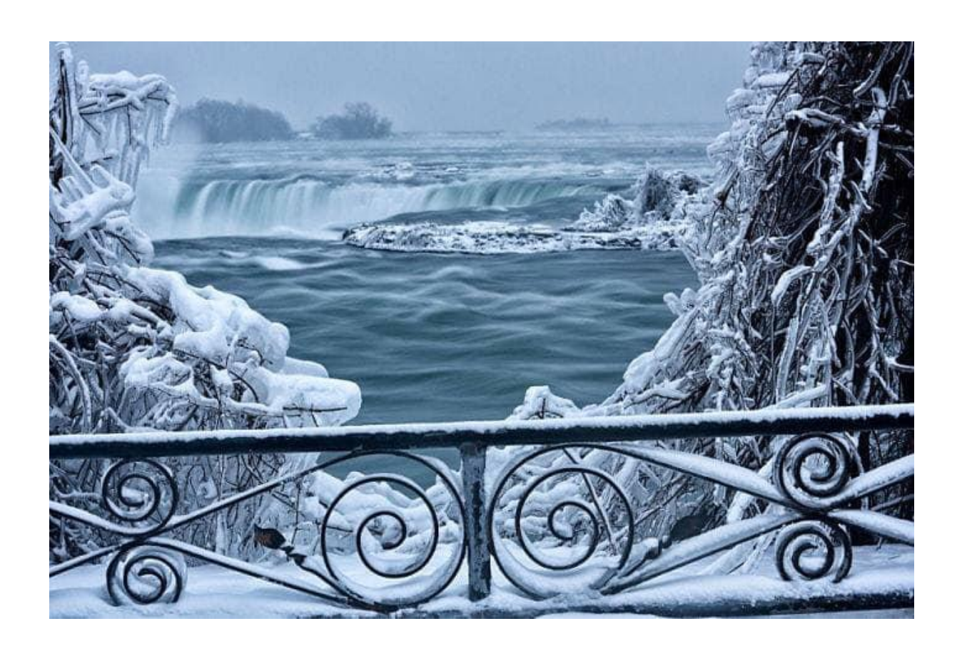
Niagara Falls January 2019 Posted by the Facebook page "Natural Niagara Falls"