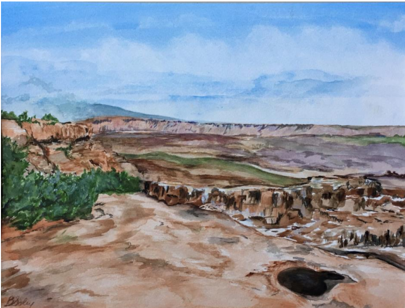
Watercolor, Canyon Ridge Bonnie Soley