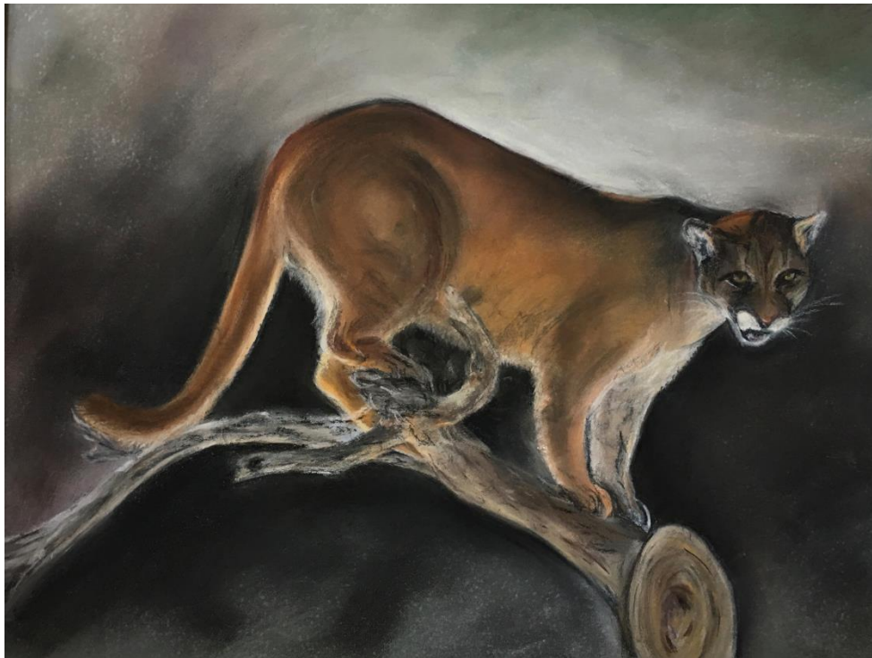
Pastel, Out on a Limb