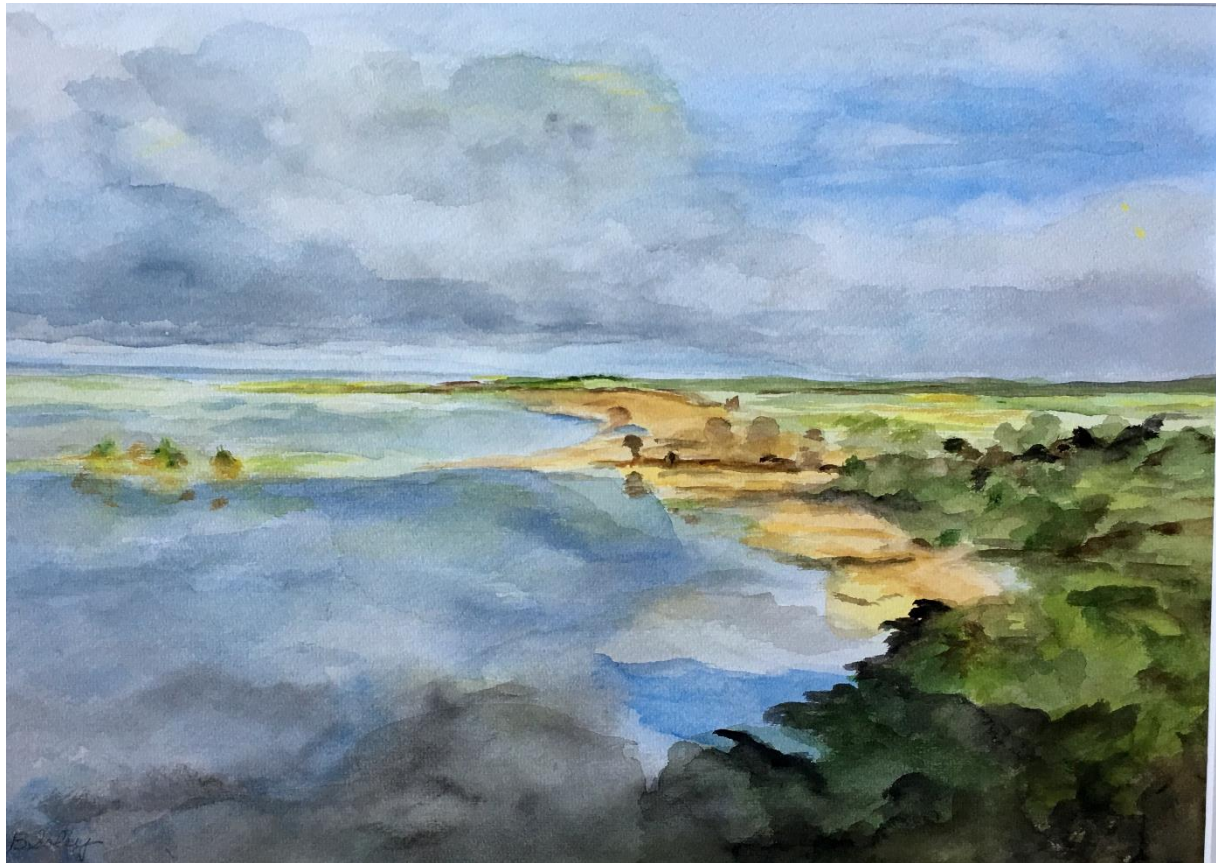
Water Color, Lake View