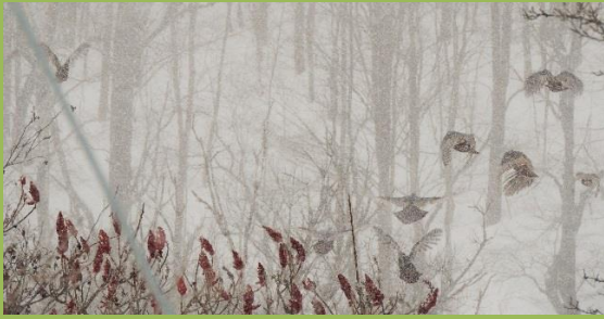
Kris Parsons 'Turkeys in Flight'